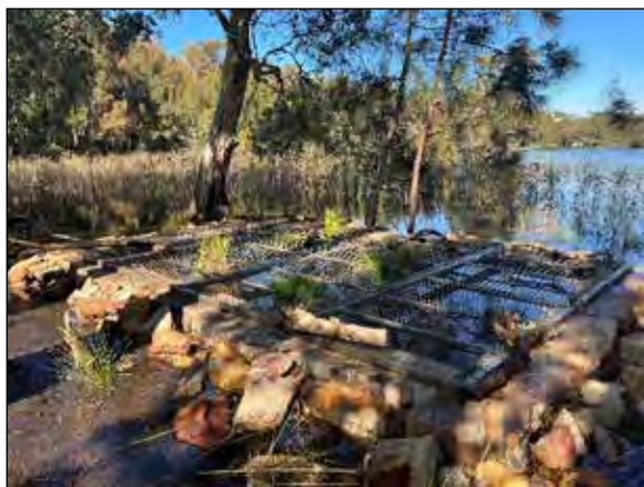
Tadpole protection pond when Lagoon open

An extra benefit of the opening was it allowed commencement of the technical study to assess flows of nutrients into and out the Lagoon.