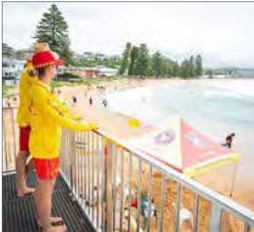
Ready for a big season

Everyone is reminded to ensure they swim between the flags, as we all know the rip beside the rock pool can be extremely dangerous. It is most important that we swim between the flags.