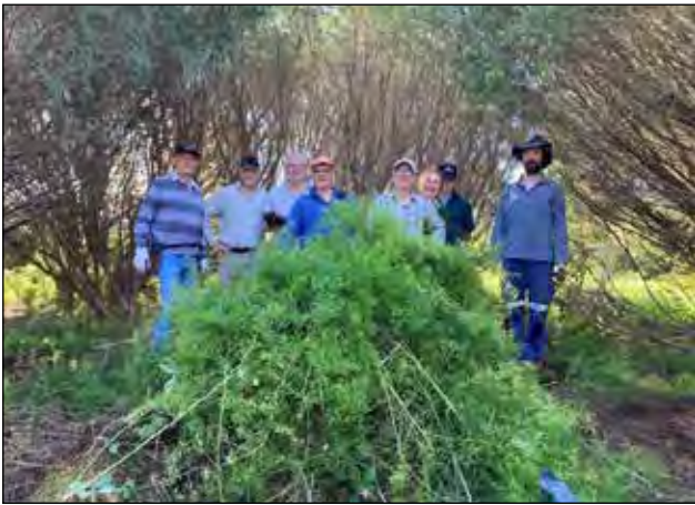
Dune Care in action