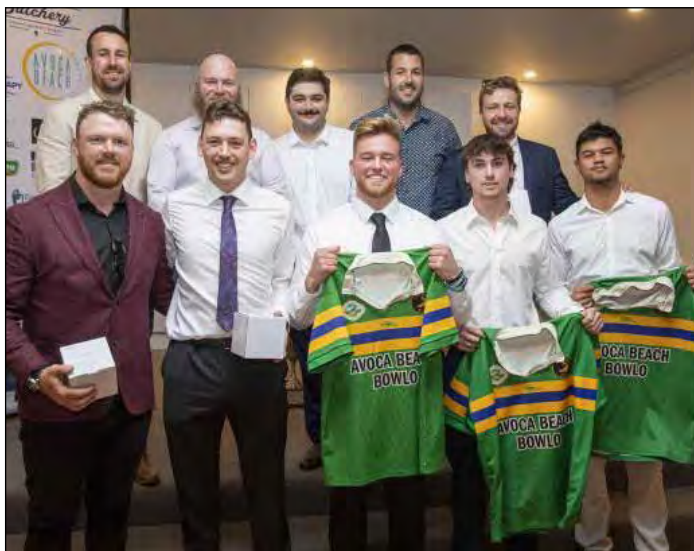
Players' Long service awards