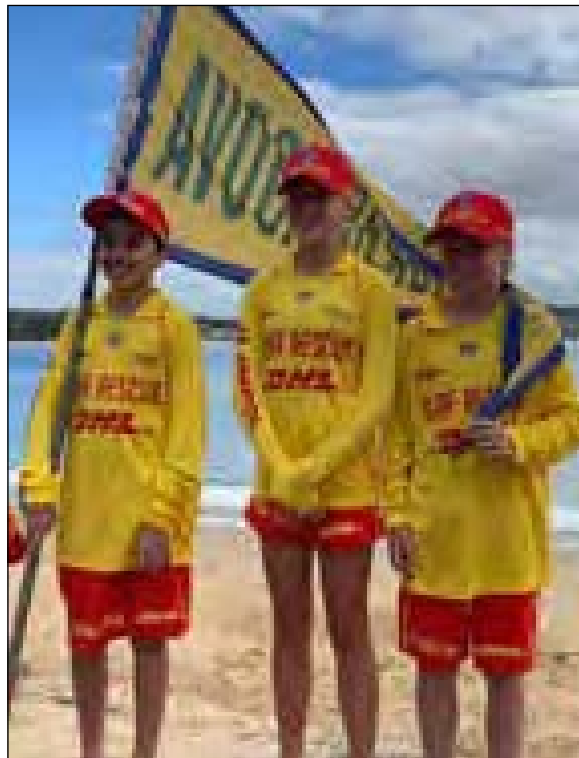
The future looks good.

Our Patrols started the long weekend with some summer holiday-like crowds on the beach.