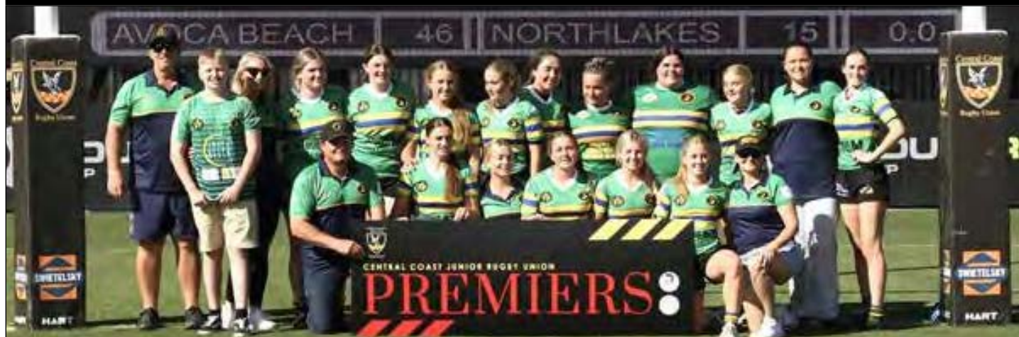
Under 16 Girls - Central Coast Premiers