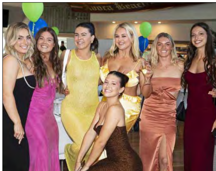
Girls Rugby. Grand Finalists Celebrate