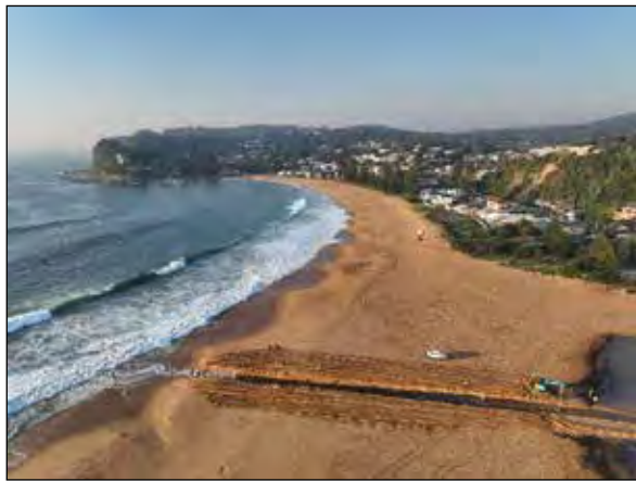
Lagoon opening September 2023

On 14 September, acting on scientific advice, Council opened the entrance discharging the Lagoon water. The salinity in the Lagoon had increased to a level preventing the breeding cycle of the endangered green and golden bell frog population located in the Bareena wetland. It also provided a means to reduce the population of fish predating on the tadpoles.