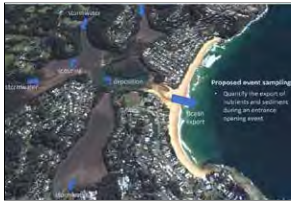
Nutrient flows at Lagoon opening

An extra benefit of the opening was it allowed commencement of the technical study to assess flows of nutrients into and out the Lagoon.