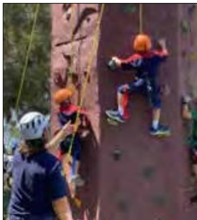
Rock Climbing Fun

We have very successfully restarted our Joey Scout section (ages 5-8), with recent activities including canoeing, camping, indoor rock climbing, ten pin bowling, science experiments, cooking, a local scavenger hunt to discover and learn things about our village, bicycle riding including safety and maintenance, a visit to the Avoca Beach RFS, attending local Anzac Day services, bushwalking, beach sports, indoor rock climbing, first aid and knotting.