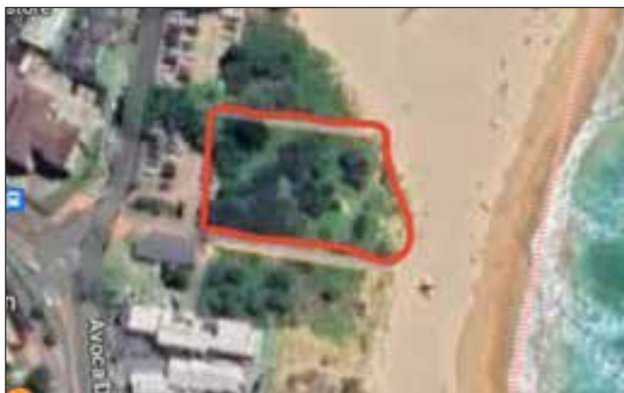
Dune care project area

To avoid this happening, we are using specific techniques that have been developed by dune care experts over the years. In a nutshell, the approach is to gradually remove the invasive weeds, and allow native plants to emerge in their place. This process is slow – it can take many years – but doing it this way minimizes the risk of losing the dunes.