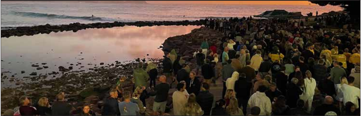
Avoca Beach Dawn Service. We pay our respects.