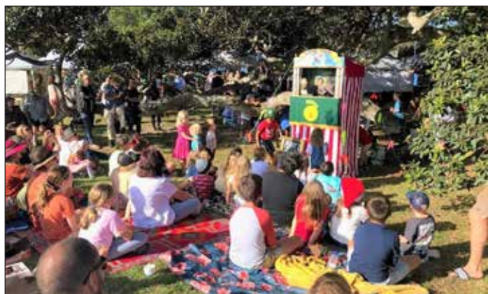
Puppets at the markets