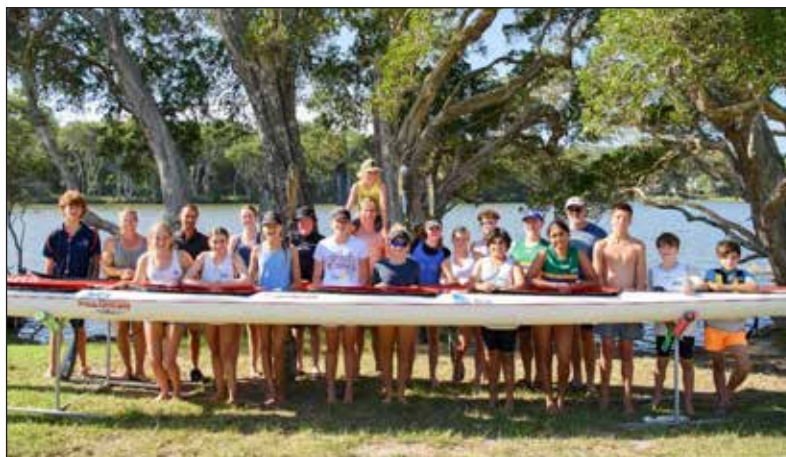
This new 4-seater will give much sought after time on the water. Thanks to the sponsors!