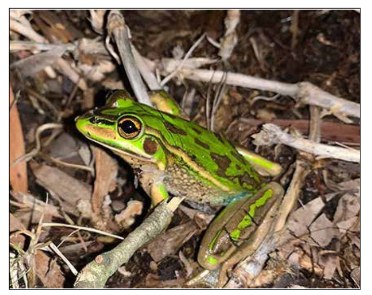
We need to care for these endangered little fellas, they are indicators of the health of our habitat.