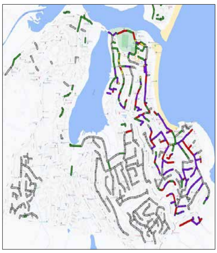
Progress on assessing condition of sewer pipes. Bright colours show lengths investigated so far and ranking of their condition. Red and purple sections will be relined by mid-2023. Grey sections form part of current phase but still to be inspected.

It is immediately evident that another major factor affecting water quality is failings in the Avoca Beach sewer system. Representatives met in July with Council senior managers, who reported on commencement of inspections of the sewer mains – 10.4km inspected by June, with 2.0km found to be degraded and has been relined. It is good news that Council has allocated $2.5 million over 4 years to complete this work across Avoca Beach. Expect the Interflow truck in your street at some point; and we do have to be a bit patient when crew operations impede traffic flow!