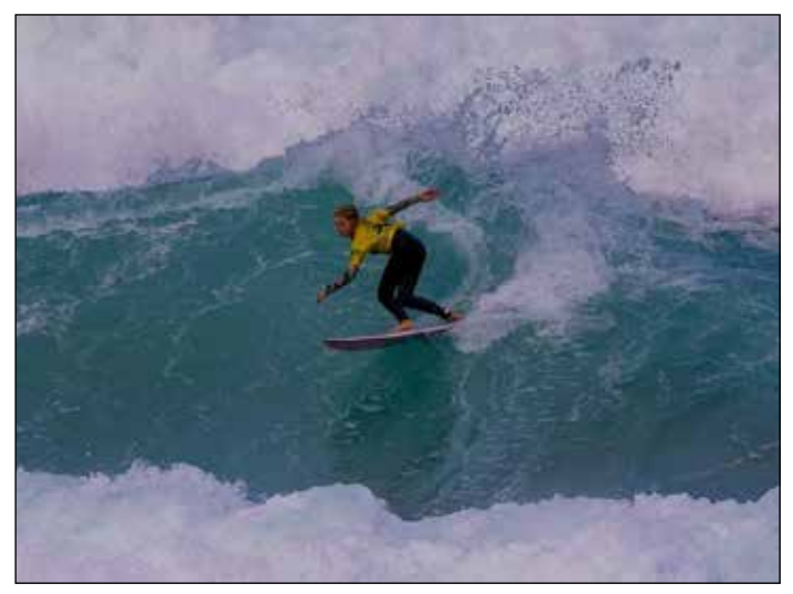
Surfing to victory at Maroubra Beach