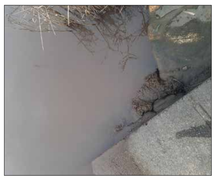
Sediment turbidity after recent rain - all not well in the catchment

Monitoring of water quality will continue until about January when it is expected that enough data and analysis will have been assembled to inform decisions on what the priority actions should be to redress the problem. Council and State Environment Department staff made a presentation in September to community representatives on progress so far. This is identifying that the large hole in the main basin, resulting from historic sand dredging, is a major reservoir of nutrients and their release into the water causing turbidity from growth of algae.