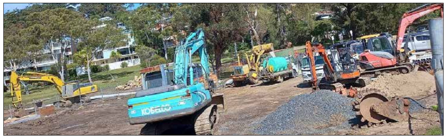
Council continues to work on the drainage problem.