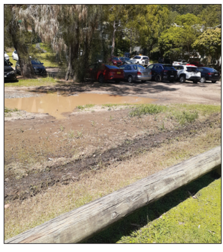
South end car park rutted and boggy - not a great experience for locals or tourists

An allocation ($200,000) is made for a study into car parking at South End Park to happen in the 3rd year. ABCA lodged a submission arguing this study should happen sooner to allow actual parking improvements funding to be listed in the subsequent triennium plan. But Council did not adopt that change –so don't hold your breath until parking improvements happen there.