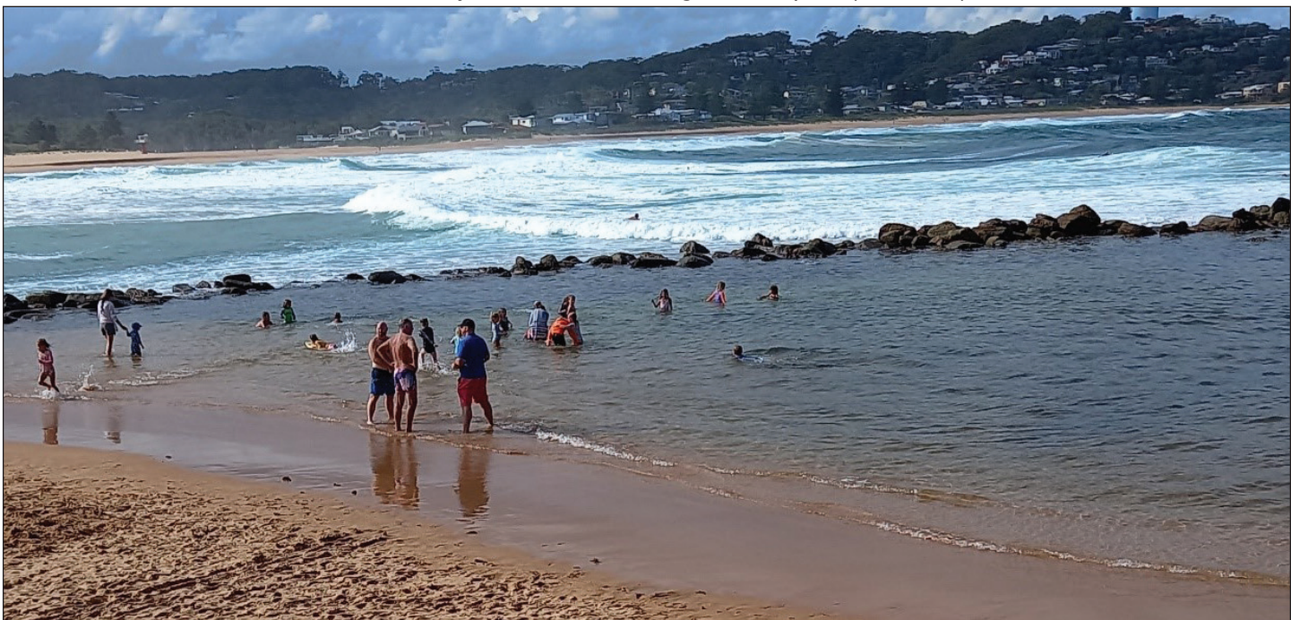
Below: Today - times have changed, rock pool (and sand)