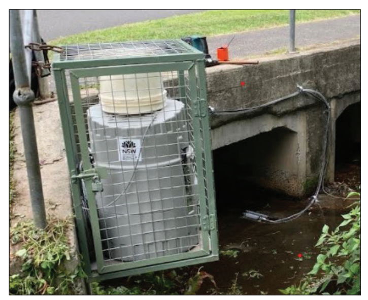
Figure 2: Auto-sampler unit above and below water on Round Drive

The project team have also installed automatic water samplers and flow sensors on the three main tributaries flowing to the lagoon – at Saltwater Creek and two locations on The Round Drive. They trigger when creek levels rise and take samples for staff to collect and process for measuring nutrient (nitrogen and phosphorus) and suspended solid loads entering the lagoon