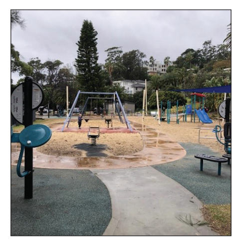
Ross Park play space today Rates and Administration

In early February, Council lodged with IPART its application for extension of the current 3-year, 15% special variation on general rates to a 10 year period. Council indicates that if that is not approved by IPART, major further reductions in staff and community services would need to happen.