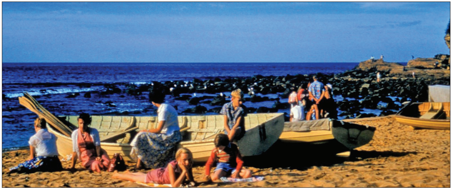
Above: The early days – before the rock pool